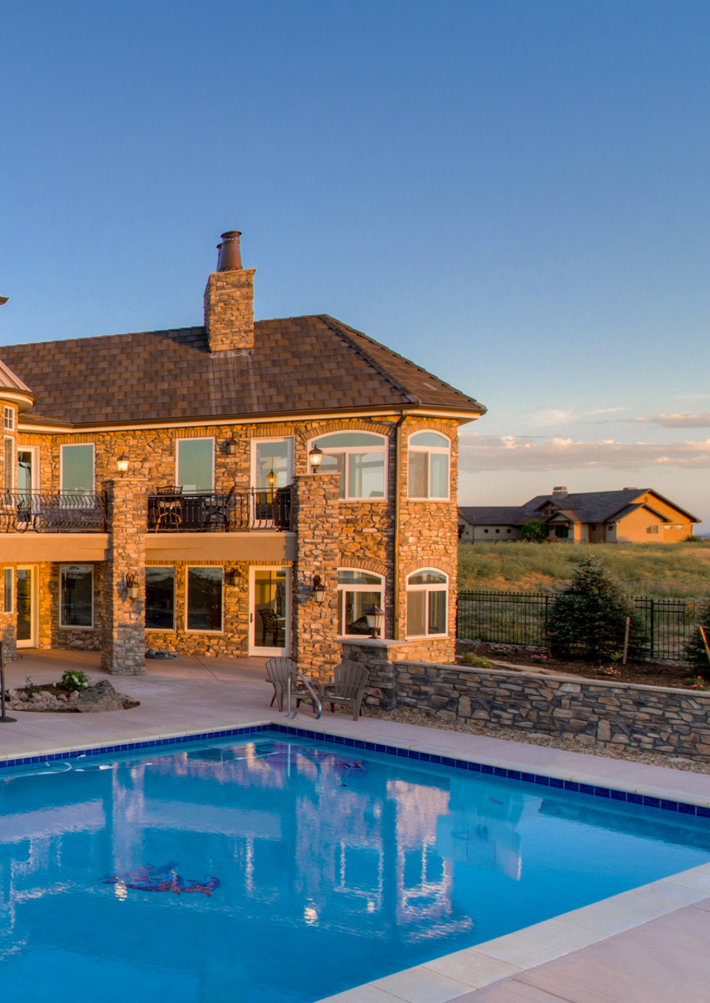
Unique home in Timnath's WildWing is a showstopper.